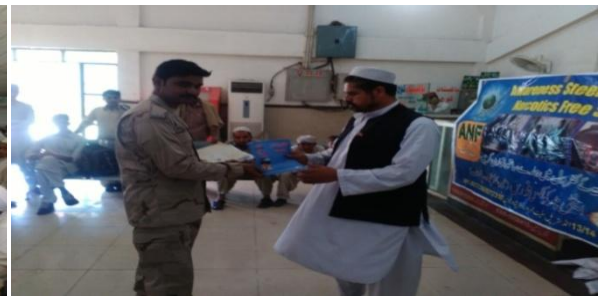
Awareness Stall at Peshawar Bus Terminal - 26 th May