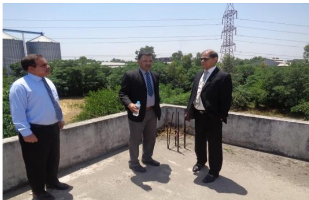
DG ANF Visit new location of MATReC, Islamabad - 27 th May