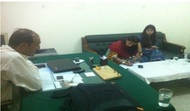
NUST Students visit MATReC, Islamabad - 29 th May