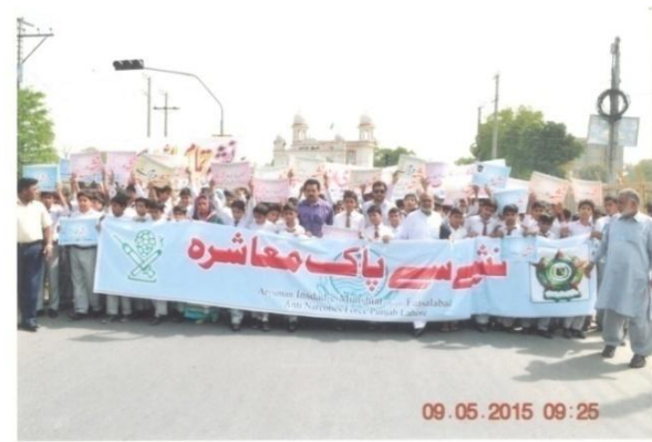
Walk at District Council Faisalabad - 9 th May