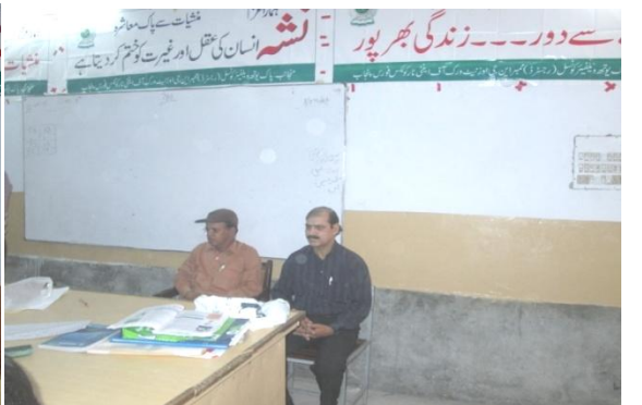
Lecture at Govt Dar Ul Furqan Boys High School Begum Pura, Lahore - 18 th May