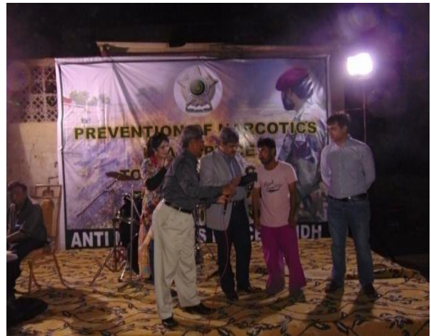
Musical Programme at Sea View, Karachi - 30 th May