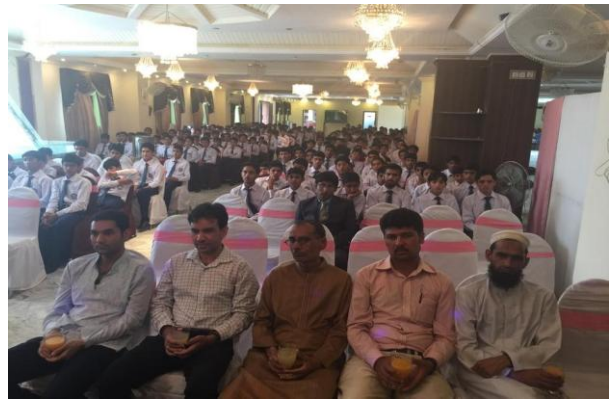
Awareness Session against drug abuse at Dr. A Q Khan School System, Ibrahim Campus, Pakistan Town, Islamabad - 11 th May