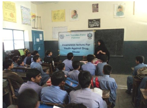
Lecture at Al Mustafa Public School Quetta - 29 th May