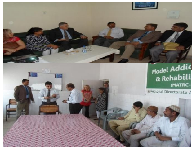
INL-P delegation visit MATReC, Islamabad - 15 th May