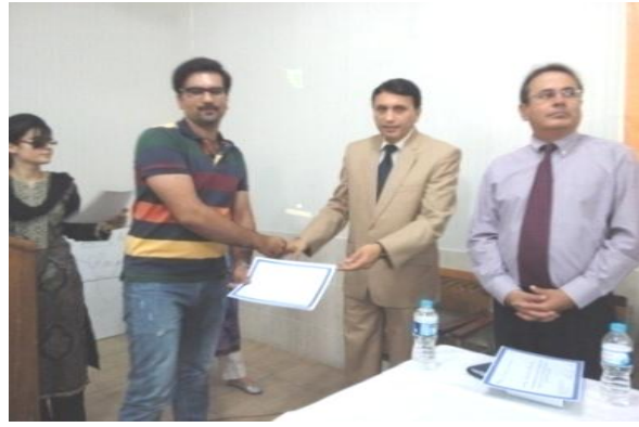
Seminar at Mayo Hospital Lahore - 8 th - 9 th May