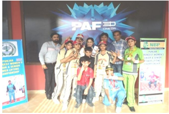
Sports Competition at PAF cinema, Lahore - 21 st May