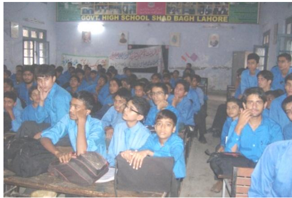
Lecture at Govt. Boys High School Shad Bagh, Lahore - 15 th May