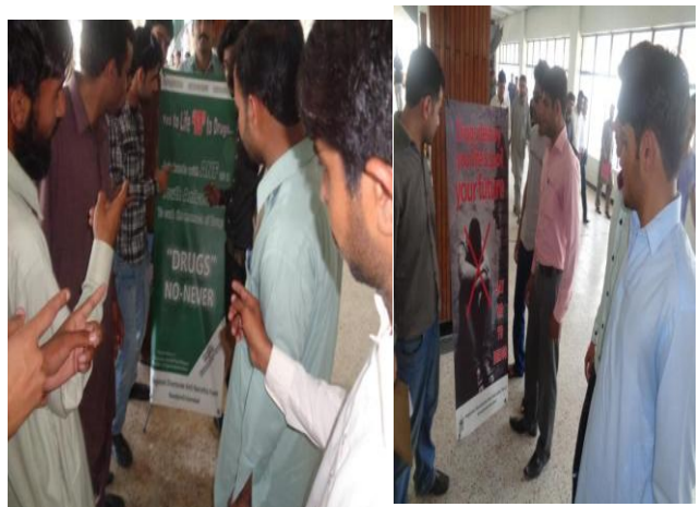
Awareness campaign against drug abuse at Islamabad Sports Complex - 19 th May