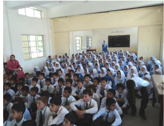
Lecture at FG Girls High School Quetta Cantt - 27 th May