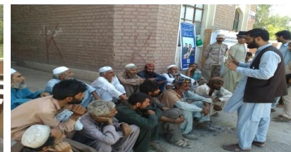
Medical Camp at New Labour Colony Hayatabad Peshawar - 27 th May