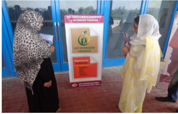
Awareness campaign of ANF-Youth Ambassadorship & Internship Program