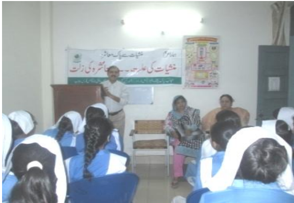
Lecture at Govt. City Girls High School Nisbat Road, Lahore - 23 rd May