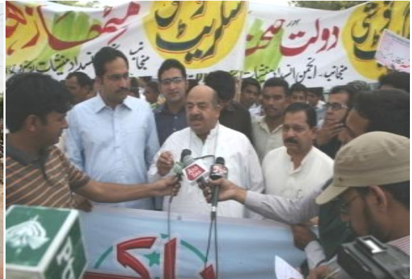
Walk at District Council Faisalabad - 25 th May