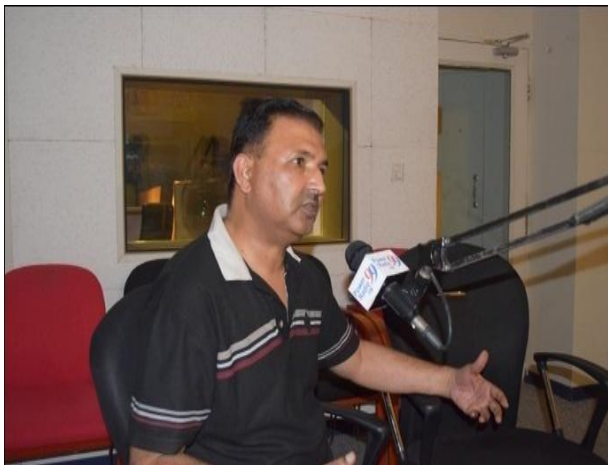
Awareness Program (Live) on FM Radio Power 99 - 20 th May