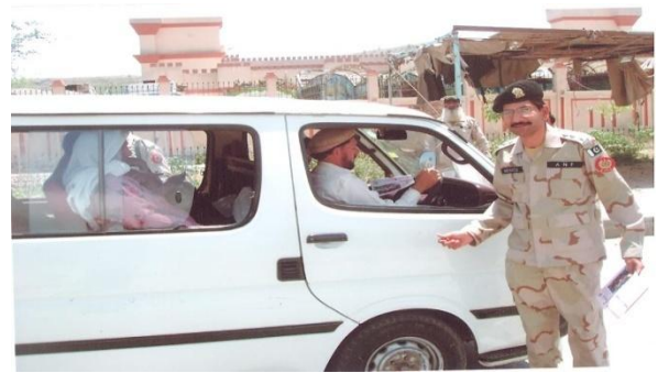
Distributing ANF Pamphlets” at Indus Highway Kohat - 19 th May