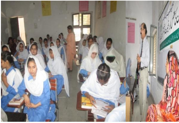
Lecture at Govt Girls Higher Secondary School Ravi Road, Lahore - 19 th May